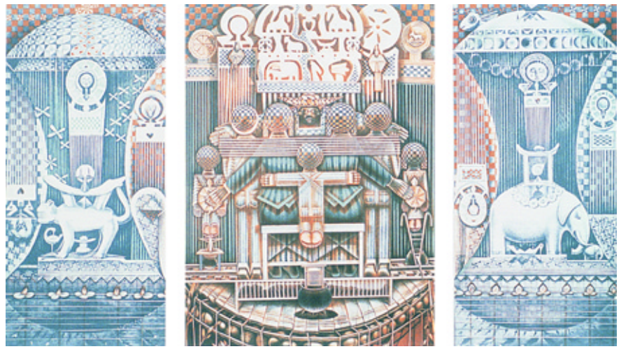
Family Arc (original color lithograph), by John Biggers, 1994, at the Student Services Building, North Carolina Central University.

In this country, programs that set aside "a percent for art" have been around since the 1940s, when Philadelphia launched the original one. By 1982, when North Carolina's General Assembly approved this state's first program, similar ones existed in nearly thirty other jurisdictions (states and cities). 7 Rather than designating a percentage of construction funds for art, as other programs did, North Carolina's Art Works in State