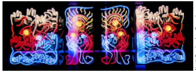
North Carolina Arts Council